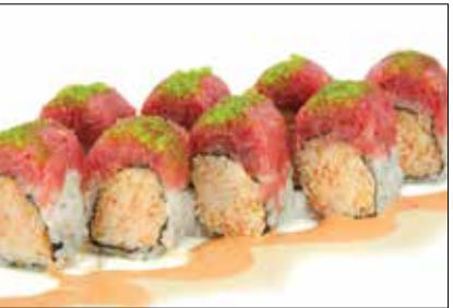
Glen Rock Roll $13