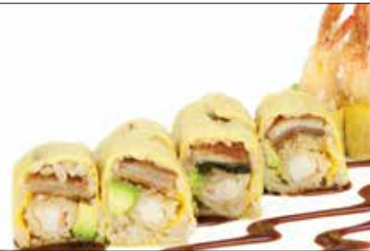
Wyckoff Roll $13