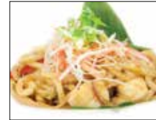
Seafood Yaki Udon $16