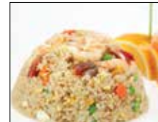
Japanese Fried Rice w. Shrimp $9