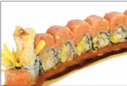
Spider Web Roll $15