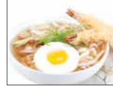
Nebeyaki Udon Soup $12