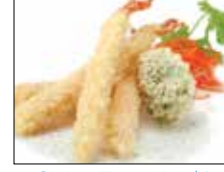
Shrimp Temp (Ap) $8