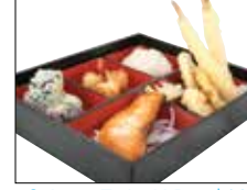
Salmon Teriyaki Box $16