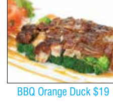
BBQ Orange Duck $19