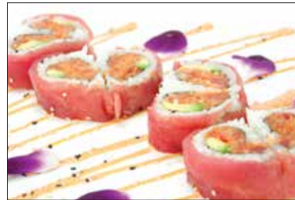
Sweet Heart $14