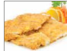
Chicken Katsu $13