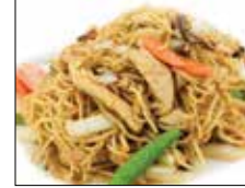
Chicken Yaki Soba $13